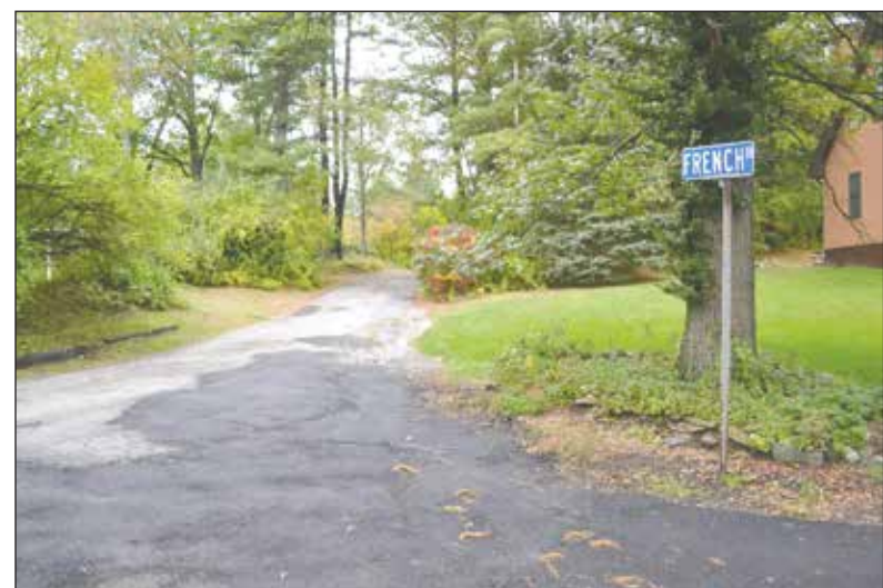
The intersection of French Drive and Faragon Avenue was heavily patched in recent days.